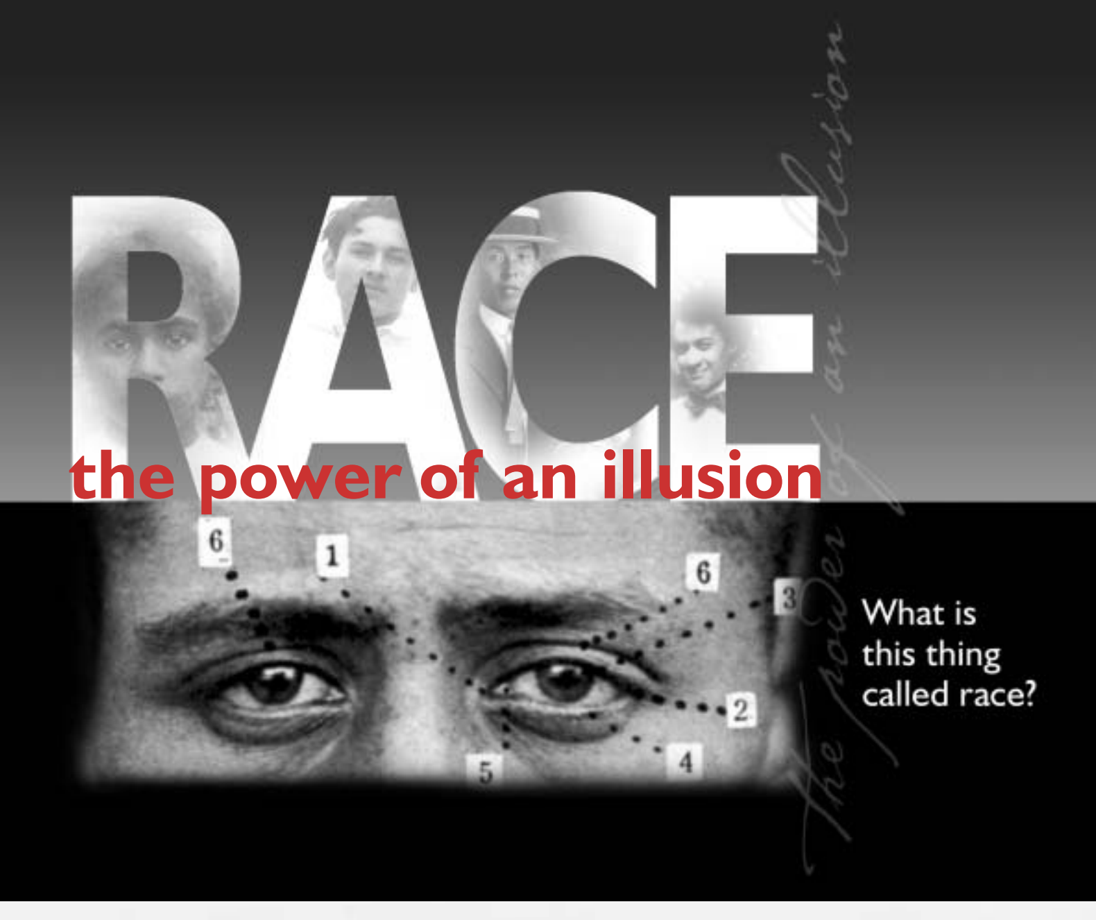
[i]tvs community connections project